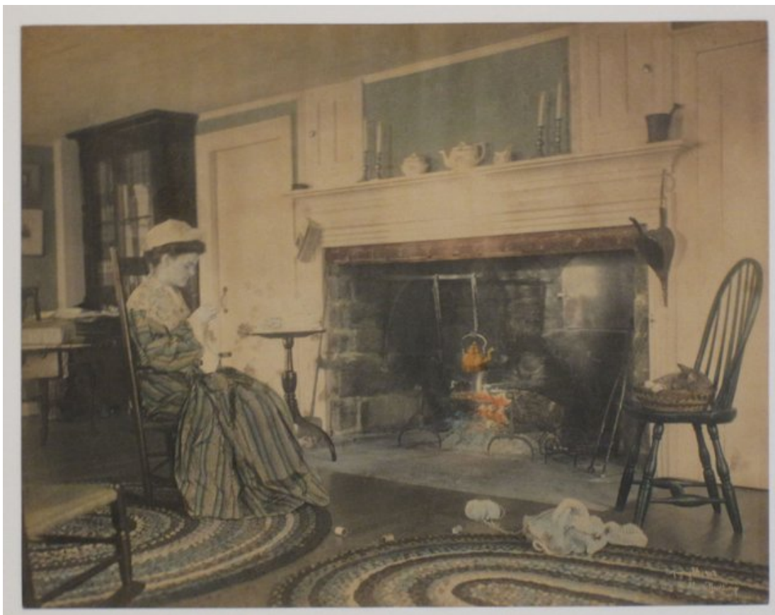
The original picture as it was bought...unframed and unmatted

We don't particularly care to collect interiors but we love animals. At the "Discovery Auction" in Danbury, there was an unframed and unmatted "Comfort and a Cat" ~ we loved the right side of the picture containing the cat. What should we do? Cut the picture in half? Why not! Our daughter Diana, the professional artist, suggested that we cut the image just to the right of the candle shadow on the fireplace mantle. It turned out to be the exact center of the image. We now have two close framed hand colored photos ~ "Comfort" (a gift for a friend that likes interiors) and "A Cat" (for our collection) ~ see photos below.