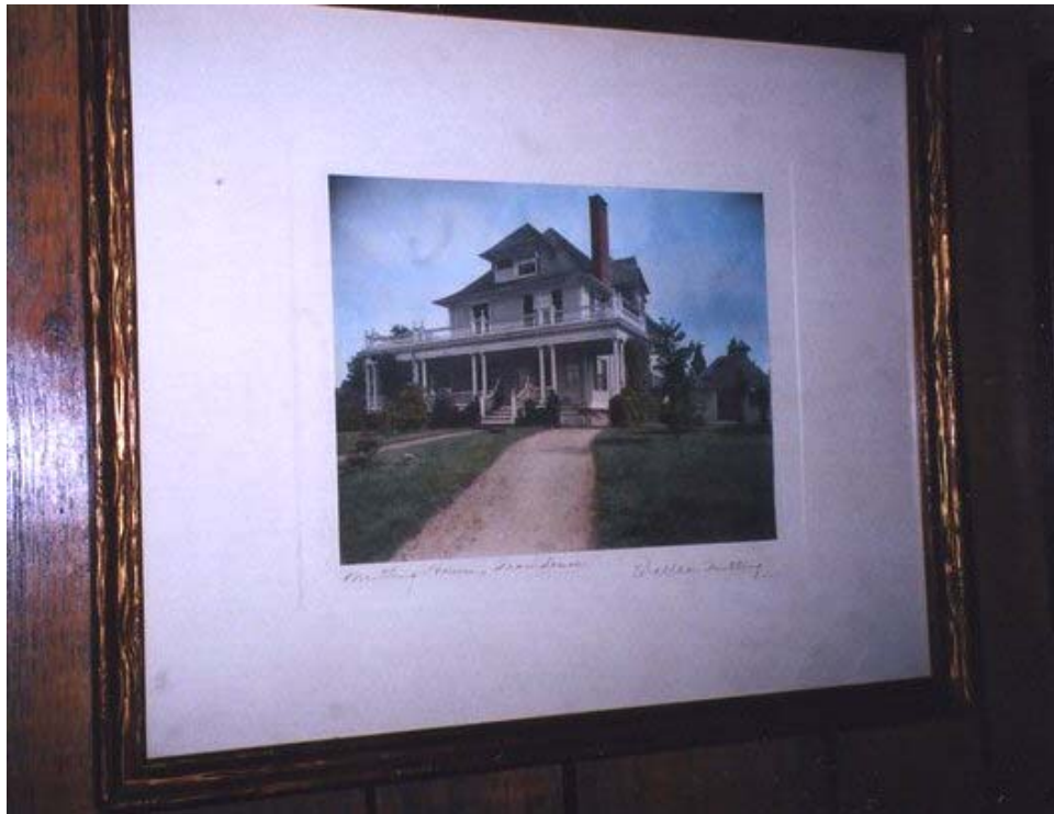
Above: "Nutting House, Providence" and below, the same house & garage today