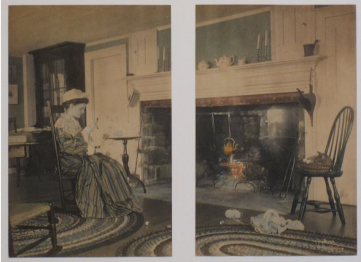
The picture divided in half, prior to framing