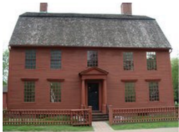
Webb House - Wethersfield, CT