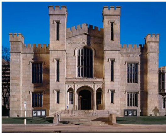
Wadsworth Atheneum - Hartford, CT

Saturday evening, May 15 – Annual Club Dinner