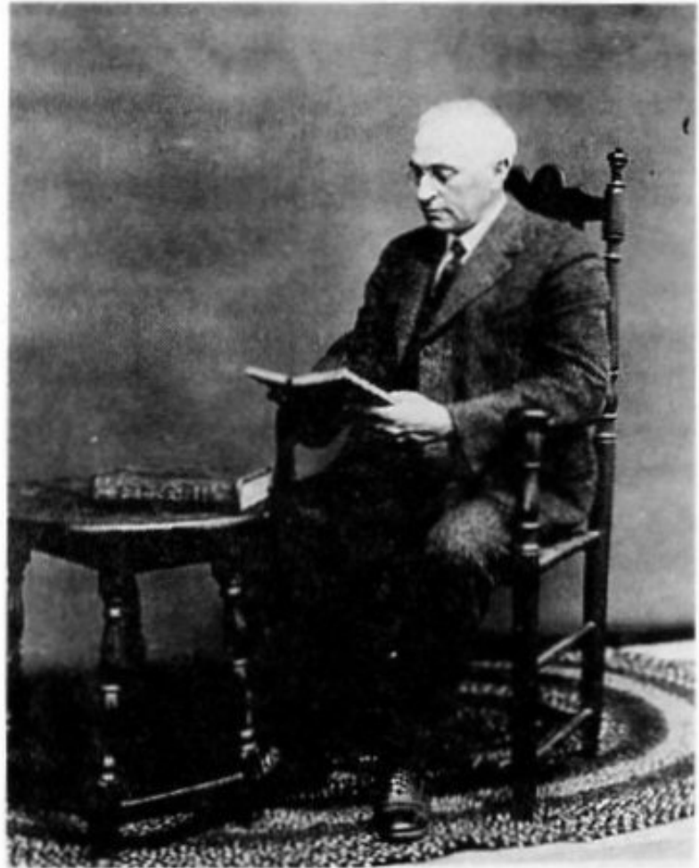
Wallace Nutting 1861-1941